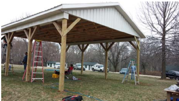
New pavilion donated by the Oshel family and dedicated in memory of Clifford Oshel