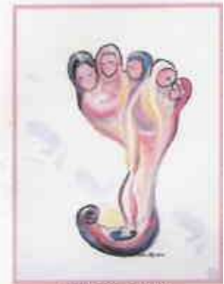
Wise & Foolish