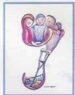
Prayer & Care