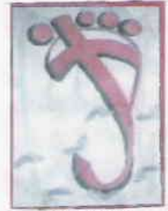
The Feet of the Cross