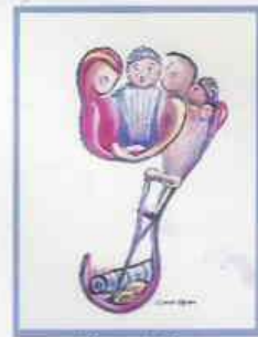
Prayer & Care