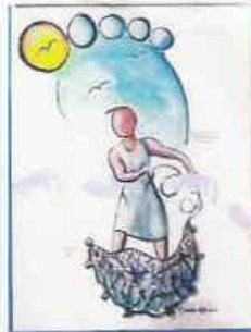
Come Follow Me