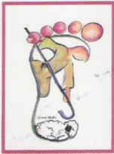
Good Shepherd - Lost & Found