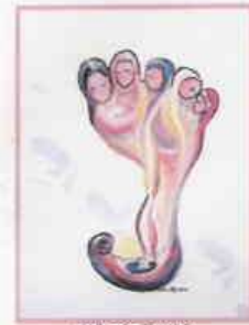
Wise & Foolish