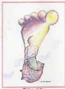
Fishers of Men