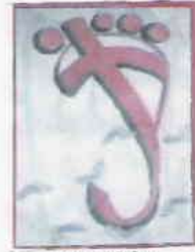
The Feet of the Cross